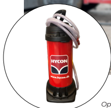
Optional Dust suppression kit Item no. 3030051

Contact us for more information: hycon@hycon.dk / +45 96 47 52 00